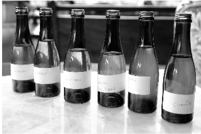
Tasting the 2008 vin clairs.